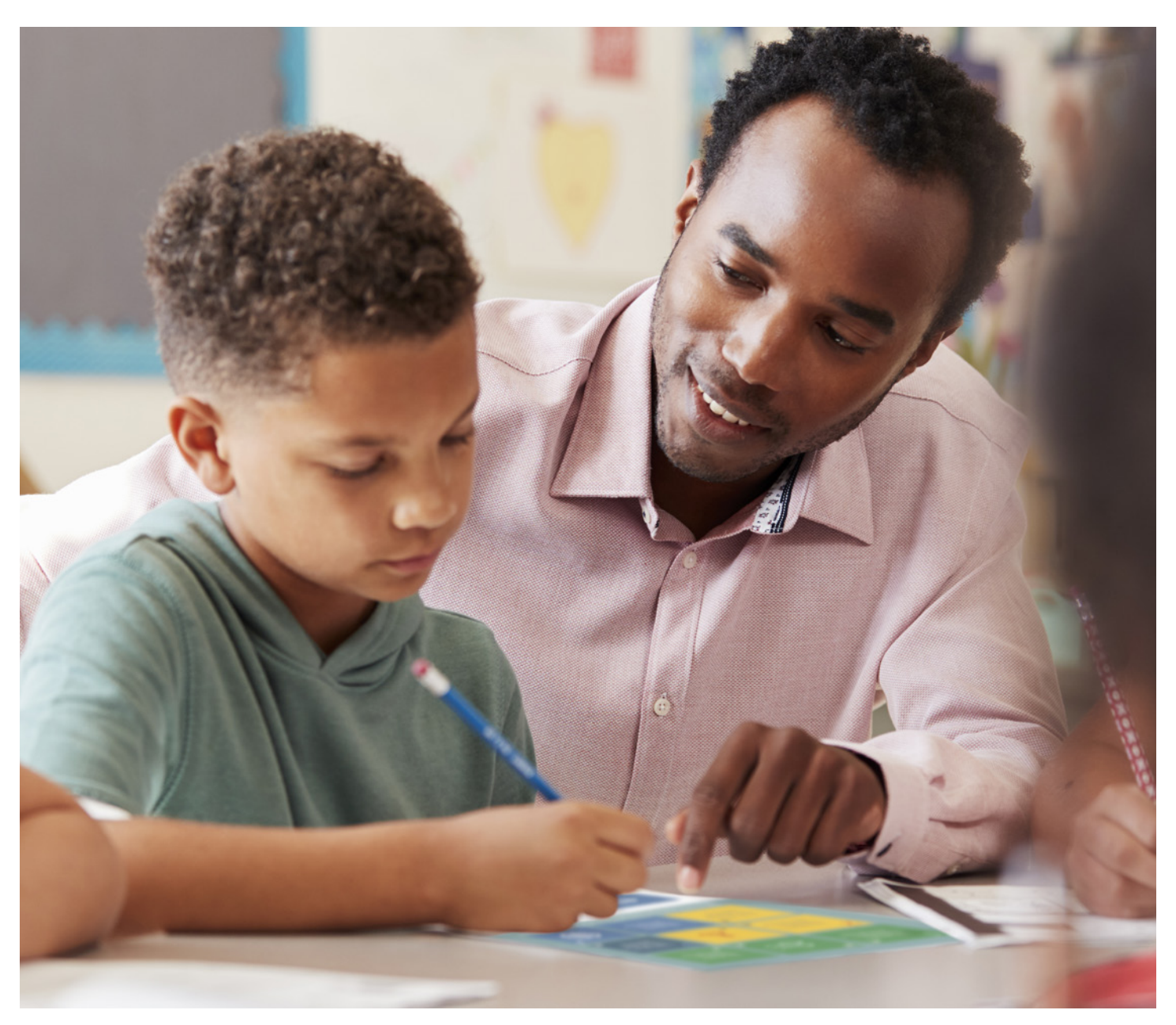
A LESSON IN ACCESSIBLE COLOR PRINT AND EDUCATION